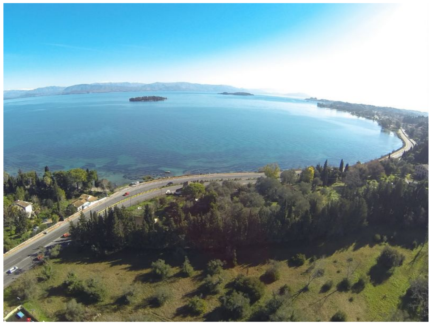
Unique plot of land of 100,000 sq.m. only 50 m. away from the beach and 5 km away from Corfu town center and airport (sold separately or as a whole)